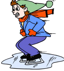
12) ice skating