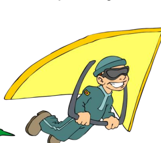
23) hang gliding