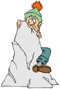
11) rock climbing