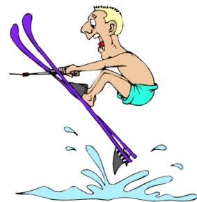
19) water skiing