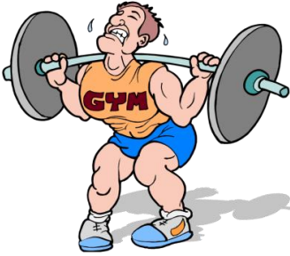
7) weight lifting